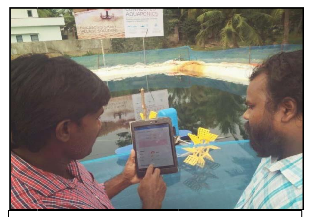
Demonstration of IoT (ICT) driven Mobile App to Aqua Farmer [networkedindia.com]