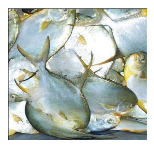
Harvested Silver Pompano, Trachynotus blochii

H. Harvesting: Harvesting of Silver Pompano could be carried out by using drag net as in the case of freshwater fish ponds. To maintain the freshness and quality of harvested fish, washing in clean water and chill-killing can be done. Harvested fishes can be stocked in plastic crates by adding layers of ice in equal quantities at the bottom and top of the fish. It is suggested that harvesting of fish can be carried out during the off season period of April to June to get a better price.